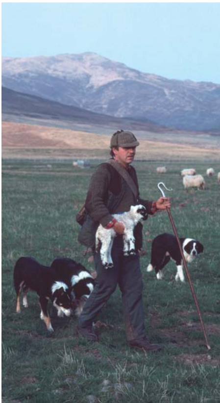
Shepherd at lambing

This first progress report for the Cairngorms National Park Plan has been prepared by the Cairngorms National Park Authority (CNPA) on behalf of all the partners who implement it. It summarises what has been achieved for the Park Plan's seven priorities for action in the first year of implementing it and highlights future work and milestones.