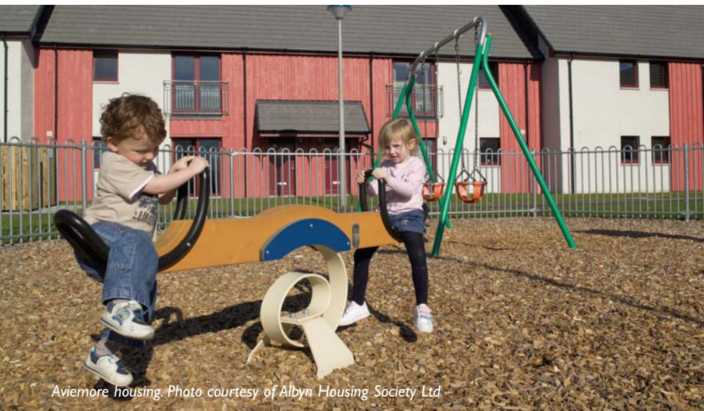
Aviemore housing.

Improving access to good quality, sustainably designed, and affordable housing to help maintain sustainable communities in the long-term.