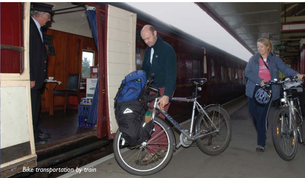
Bike transportation by train

Increasing the diversity, vibrancy and sustainability of the economy of the Cairngorms National Park.