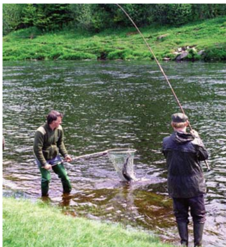
Landing a salmon

This year's progress report reflects the early stage of implementation of the Cairngorms National Park Plan. Over the next year (2008/09), we expect the Park Plan and the priorities for action to become more embedded in all of our ways of working. This will drive a step-up of delivery that will contribute to the outcomes for 2012 for each priority for action.