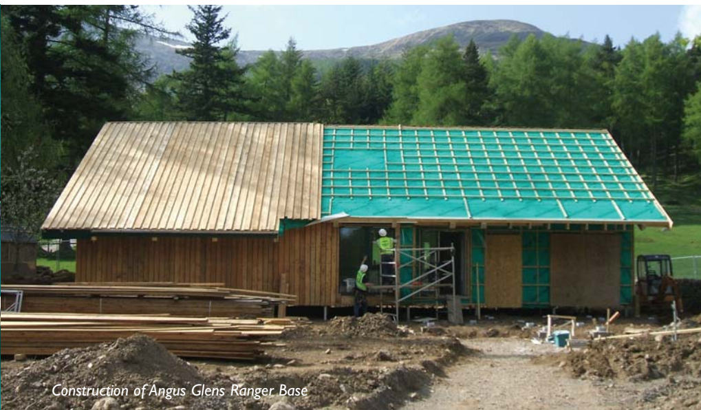
Construction of Angus Glens Ranger Base

Increasing awareness of the Cairngorms National Park and its special qualities throughout the Park and Scotland.