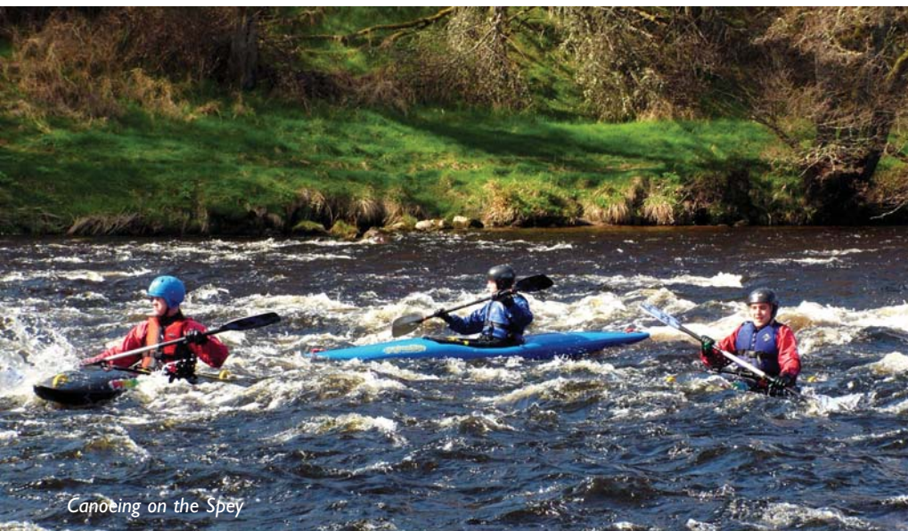
Canoeing on the Spey