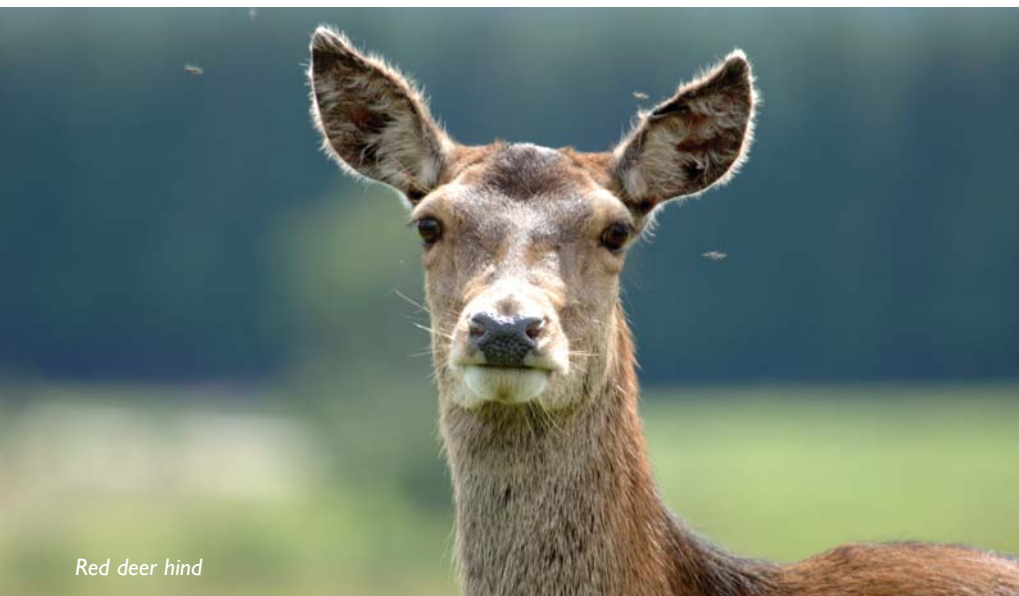
Red deer hind

Balancing the social, economic and recreational benefits that deer bring with the ecological processes in which deer are a natural part.